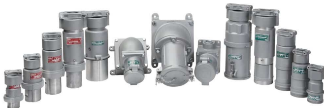
PLUG & SOCKETS