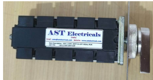
MULTIPOSITION D'CON SWITCHES